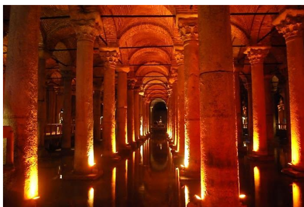
6 th Century Byzantine water cistern in Istanbul.