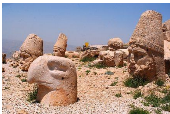
Photo: Stone heads and God statues of Mt Nemrut.

On this tour, we see Armenian and Georgian churches with exquisite stone reliefs, the awe inspiring Mt Ararat , the medieval site of Hasankeyf , the newly uncovered archaeological site of Gobekli-tepe and more. On Mt Nemrut , we ponder over the stone heads and god statues of the pre-Roman king Antiochus . We marvel at centuries old castles, old Roman bridges and pass through the plains of Mesopotamia and the giant Ataturk Dam that tames the Euphrates River. Beehive houses of Harran , the Old Testament town of Sanliurfa and Gaziantep Museum housing the exquisite mosaics of Zeugma are amongst other fascinating sites of this culture rich region.