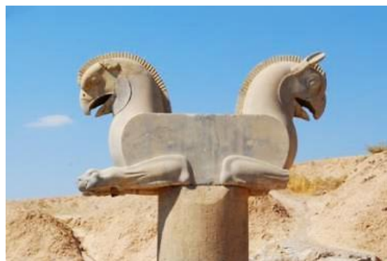
Photo 2: The lion column capitals from the ancient city of Persepolis (right).

Date: 07 October2014: Prices: From $3,450