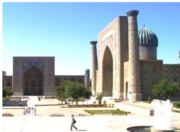
Photo: Part of the Ragistan complex in Samarkand, Uzbekistan

Date: 16 April 204 Prices: From $3,350 (See page 7 for more details).