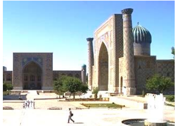
Photo: Part of the Ragistan complex in Samarkand, Uzbekistan

With fascinating kales (castles), exquisitely decorated madrassas (Islamic high educational institutions), towering minarets, colourful markets, these cities have a very rich architectural and cultural heritage. During the tour, we see all these intriguing centres. Our tour starts in Istanbul and ends in Tashkent, Uzbekistan, from where we fly back to Istanbul or to other ongoing destinations.