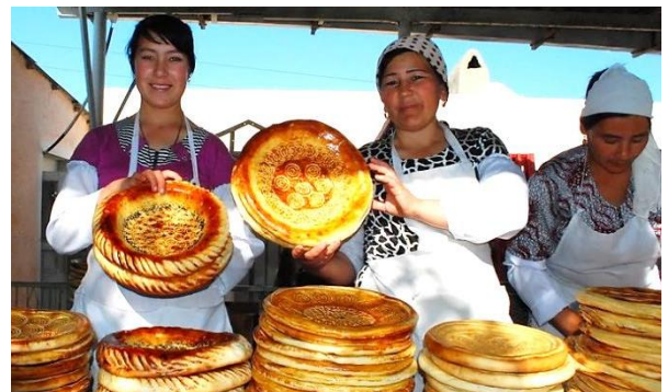
Road side bread ladies in Fergana Valley