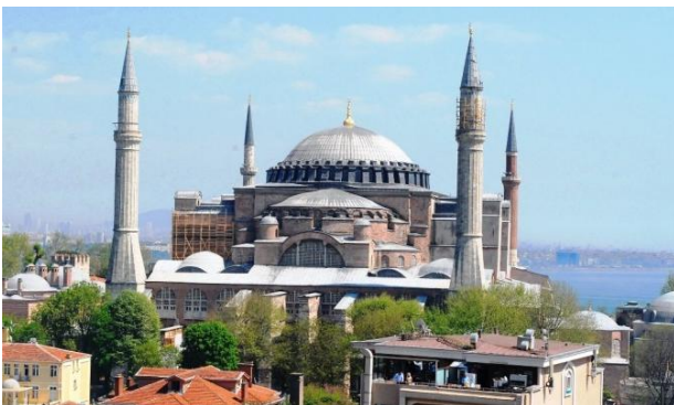
The 6 th Century Hagia Sophia that dominates Istanbul's skyline