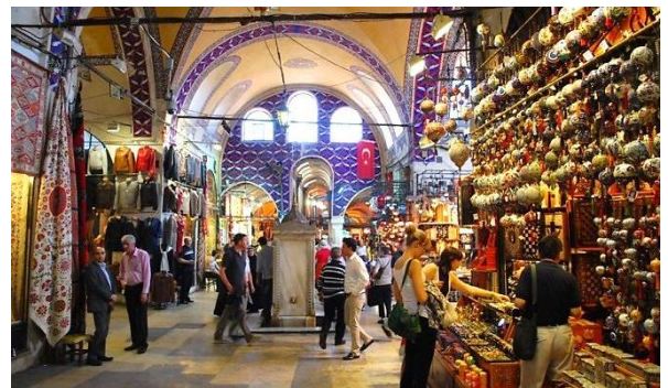
The magnificent Grand Bazaar in Istanbul

The tour started in Istanbul in Turkey where participants experienced this exotic city at the end of the Silk Road before venturing east to Central Asia. They visited bazaars such as the Grand Bazaar and the Spice Bazaar. They admired some of the many historic monuments from both the Byzantine and the Ottoman periods, such as the 6 th Century Hagia Sophia , the magnificent Blue Mosque and unrivalled Topkapi , the Ottoman Palace from where Sultans ruled the empire for over 400 years.