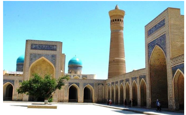
The Kalyan Mosque Complex in Bukhara

intrigue and mystery like no other, which we experience firsthand during our tour of this fascinating region.