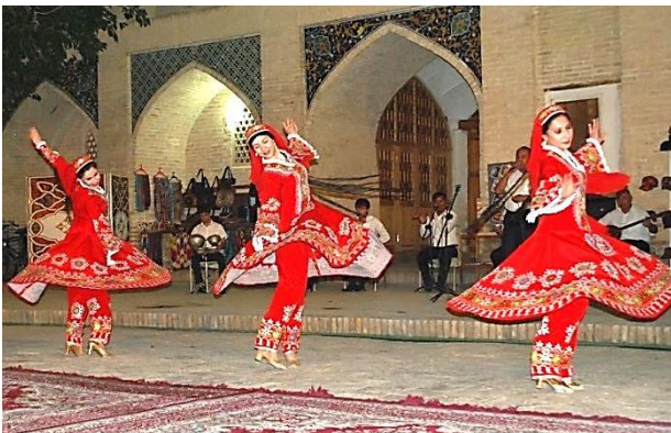
Traditional dancers in full flight in Bukhara