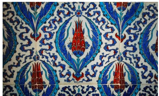
Iznik tiles in the 16 th Century Rustem Pasha Mosque