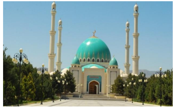
Goktepe Mosque near Ashgabat