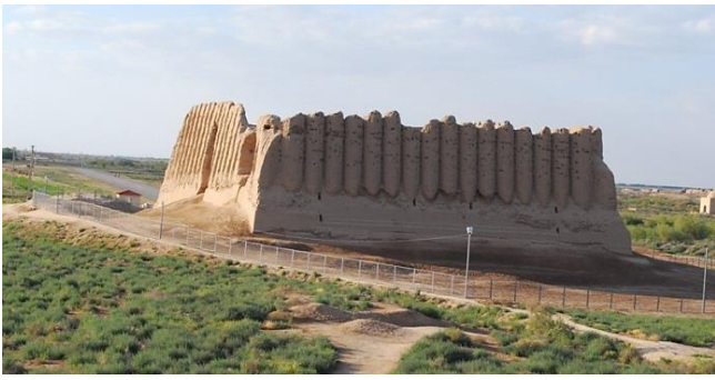
Ruins of a Palace at ancient Merv