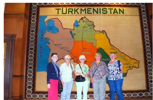
Group members in front of a 'carpet' map in the Carpet Museum in Ashgabat

Next country on the itinerary was Turkmenistan, a country of extreme contrasts. There aren't many countries where you find ruins of mud-brick buildings from the medieval period (ancient cities of Merv and Nusay ) side by side with opulent marble monuments and palaces adorning the wide boulevards of Ashgabat or vast expanses of desert (the Karakum Desert) co-existing with green, lush gardens and parks of Ashgabat . It is these contrasts that make Turkmenistan so appealing.