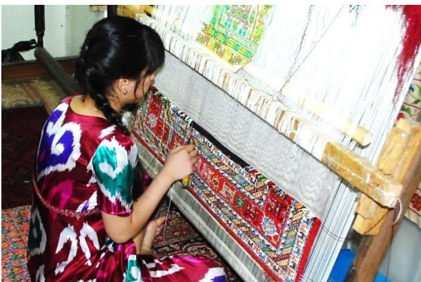
A carpet weaver in traditional silk dress in Bukhara