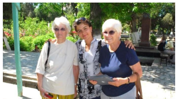
Group members with a friendly charming local girl