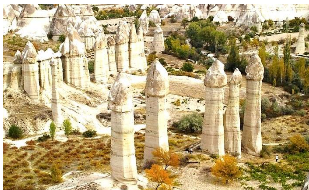
One of the amazing formations in Cappadocia