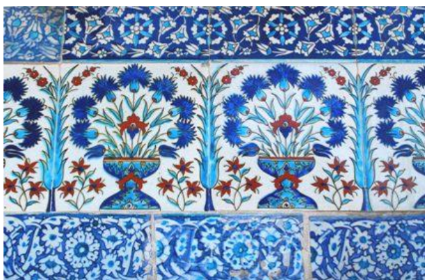
15 th Century Iznik tiles in Topkapi Palace —not even our high Aussie $ can buy!!!!

Unless you live on a desert island isolated from the modern world, you will know that the Australian dollar is riding high. At the time of writing, one AUD buys over 0.85 Euros, a record high, and well over $1.05 USD. This is obviously not good news for many sectors of the economy including manufacturing, domestic tourism and the export sector but, it is very good news for people travelling overseas. With the resources sector now coming off the boil, this state of affairs is unlikely to last and the Aussie will inevitably drop to more sustainable levels. So the message for people planning overseas trips is DO IT SOON!!!