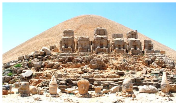
Stone heads and God statues of Mt Nemrut

On this tour, we see Armenian and Georgian churches with exquisite stone reliefs, the awe inspiring Mt Ararat , the medieval site of Hasankeyf , the newly uncovered archaeological site of Gobeklitepe and more. On Mt Nemrut , we ponder over the stone heads and god statues of the pre-Roman king Antiochus . We marvel at centuries old castles, old Roman bridges and pass through the plains of Mesopotamia and the giant Ataturk Dam that tames the Euphrates River. Beehive houses of Harran , the Old Testament town of Sanliurfa and Gaziantep Museum housing the exquisite mosaics of Zeugma are amongst other fascinating sites of this culture rich region.