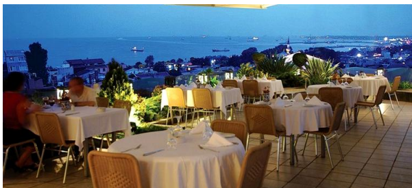
Terrace restaurant overlooking the Marmara Sea