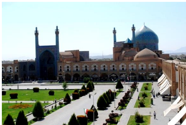
Part of the vast Naqsh-e Rostam Square with Imam Mosque in the background

We enjoyed Shiraz and Yazd but Esfahan was, as you predicted, the highlight. The square, the mosques and palaces make it a world-class place. We were glad you had saved it for the end of our trip.