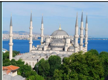
The world renown Blue Mosque in Istanbul

Year Tour dates: 2013: 10 May and 06 Sep 2014: 09 May and 05 Sep