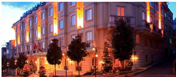
Exterior of Eresin Crown hotel

We have been using good, four-star hotels located in the historic old city in Istanbul for our tours. While we are happy with these hotels, some of their rooms are rather small. So for our future tours, we have decided to upgrade to a superior hotel with larger rooms and still with excellent customer service. The hotel we plan to use is Eresin Crown Sultanahmet. Its web site link is http://www.eresin.com.tr/default-en.html , so you can check it for yourselves.