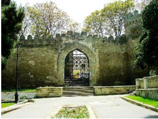
One of the gates to the medieval city Icheri Sheher

On this tour, we will see attractions of contrasts in a country of contrasts. In Baku, we visit historic caravanserais, mosques, the palace of the Shirvanshahs , a carpet museum and the walled medieval city of " Icheri Sheher " with its narrow alleyways. We take an excursion to the Absheron Peninsula , visiting the Zoroastrian Fire Temple and Yanardagh (Burning Mountain) and Gobustan with its ancient petroglyphs.