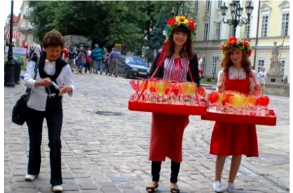
'Candy Girls' in Lviv

Lviv is a charming, 'poetic' city that is steeped in legends both ancient and relatively new! In spite of its turbulent history and the Soviet era indifference, it retains its Ukrainian spirit and its delicate architecture so much so that it is included in the UNESCO World Heritage list.