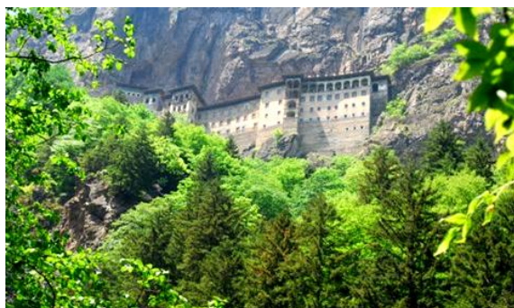
Monastery perched on a mountain ledge near Trabzon

With its rich culture and friendly people, the Black Sea Region of Turkey is a real gem. It is adorned with majestic mountains, lush forests and tea growing hills. It is well off the beaten track and you will be one of few Western visitors in the area.