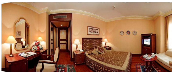
One of the guest rooms