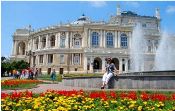
The magnificent Odessa Opera House

Ukraine is a country that rewards travellers with heartfelt hospitality, magnificent architecture and prominent historical sites. Main attractions of the capital Kiev include the 11th century St Sophia Cathedral with the country's greatest mosaics and frescoes, and the Cave Monastery complex on the banks of Dnipro River . The vibrant Khreshchatyk (the Champs Elysees of Kiev) is popular with the locals at weekends. We also visit the major port city of Odessa on the Black Sea coast and Lviv in Western Ukraine. Odessa's attractions include the famous ' Catacombs ', a series of underground tunnels and living quarters, and its famous Opera House.