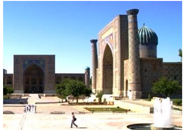
Part of the Ragistan complex in Samarkand, Uzbekistan